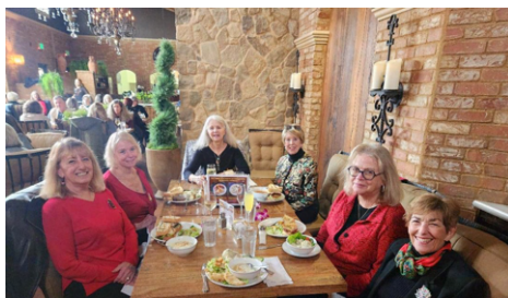
Gourmet Girls cooking group at their Christmas lunch at Pottery Barn.

If you have any questions, ideas or are interested in forming a new group, please contact the Activity Groups Chair.